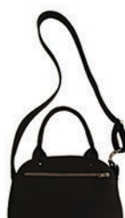
mini travel bag with zipper