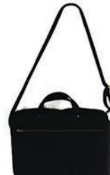
working bag with zipper and padding